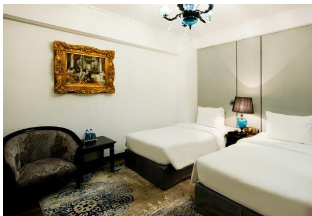
A & EM SIGNATURE HOTEL